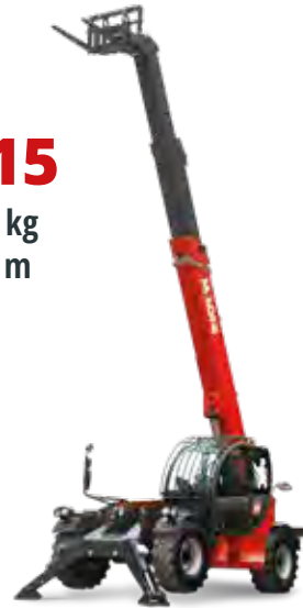
Deutz 55,4 kW (75,3 hp) @ 2,200 rpm