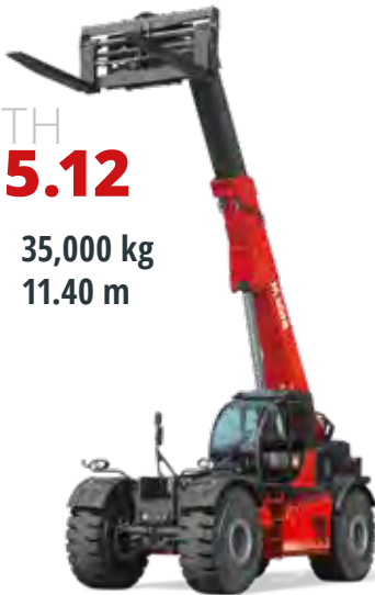
Volvo 250 kW (340 hp) @ 2,200 rpm