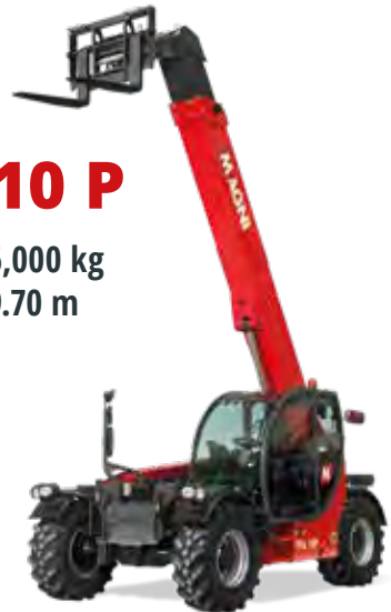
Deutz 74,4 kW (101,2 hp) @ 2,200 rpm