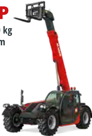
Deutz 74,4 kW (101,2 hp) @ 2,200 rpm