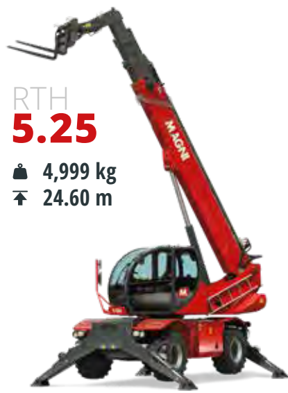
Deutz 100 kW (136 hp) @ 2,200 rpm