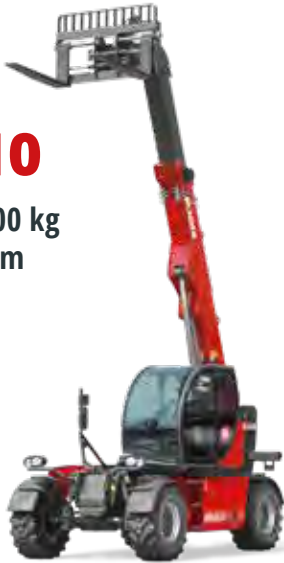
Deutz 100 kW (136 hp) @ 2,200 rpm