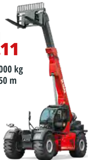
Volvo 175 kW (238 hp) @ 2,300 rpm