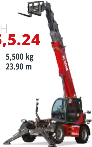
Deutz 100 kW (136 hp) @ 2,200 rpm