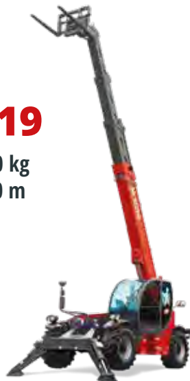
Deutz 55,4 kW (75,3 hp) @ 2,200 rpm