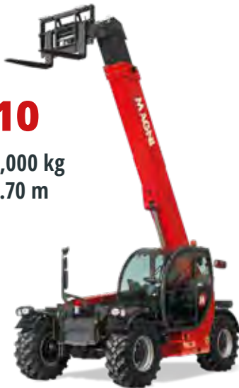
Deutz 55,4 kW (75,3 hp) @ 2,200 rpm