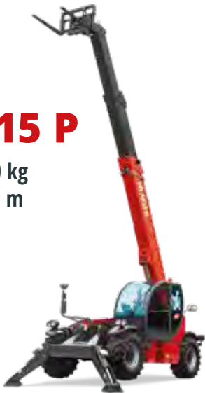
Deutz 74,4 kW (101,2 hp) @ 2,200 rpm