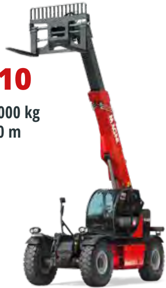
Volvo 160 kW (218 hp) @ 2,200 rpm