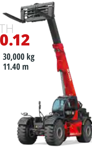
Volvo 235 kW (320 hp) @ 2,200 rpm