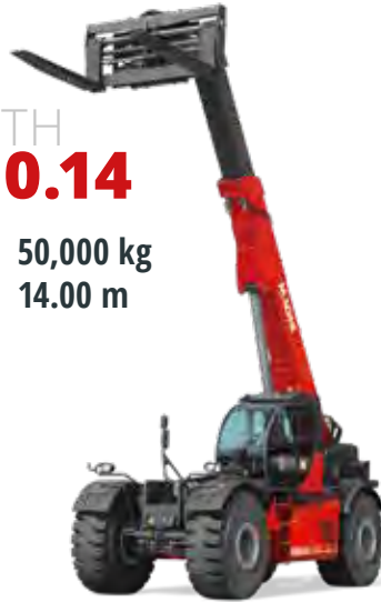
Volvo 235 kW (320 hp) @ 2,200 rpm