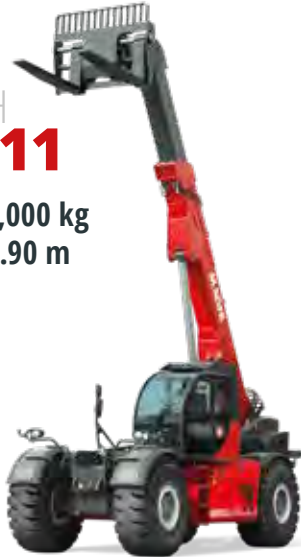
Volvo 175 kW (238 hp) @ 2,300 rpm