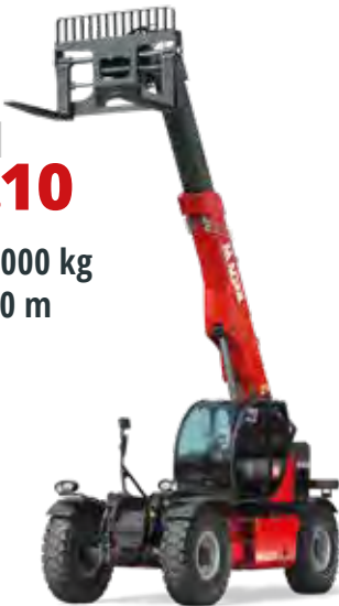
Volvo 160 kW (218 hp) @ 2,200 rpm